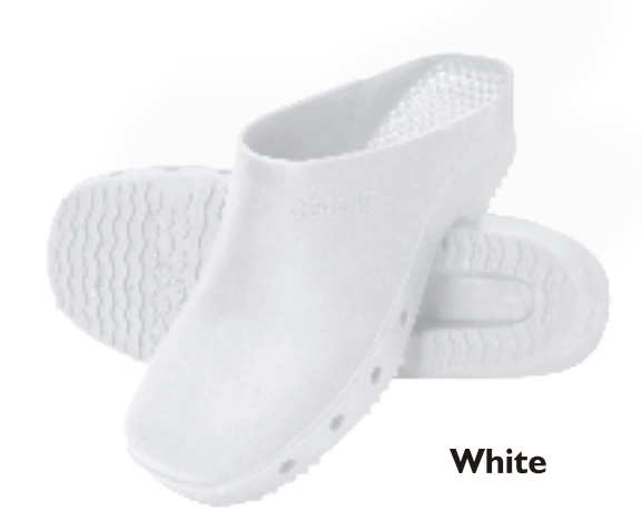
Özgenç Antistatic Operating Room Clog